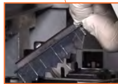
Replaceable Print Wiper