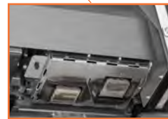
Staggered Dual Print Heads