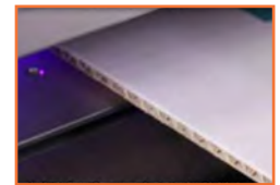
Media Thickness Detection Sensor

MUTOH's genuine VerteLith RIP software bundled with FlexiDESIGNER MUTOH Edition 21 optimizes the VJ-1638UH Mark II through these key features: