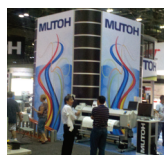
Trade Show Displays